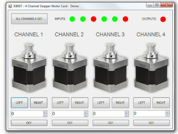
THE SOFTWARE CAN BE DOWNLOADED FROM OUR WEBSITE